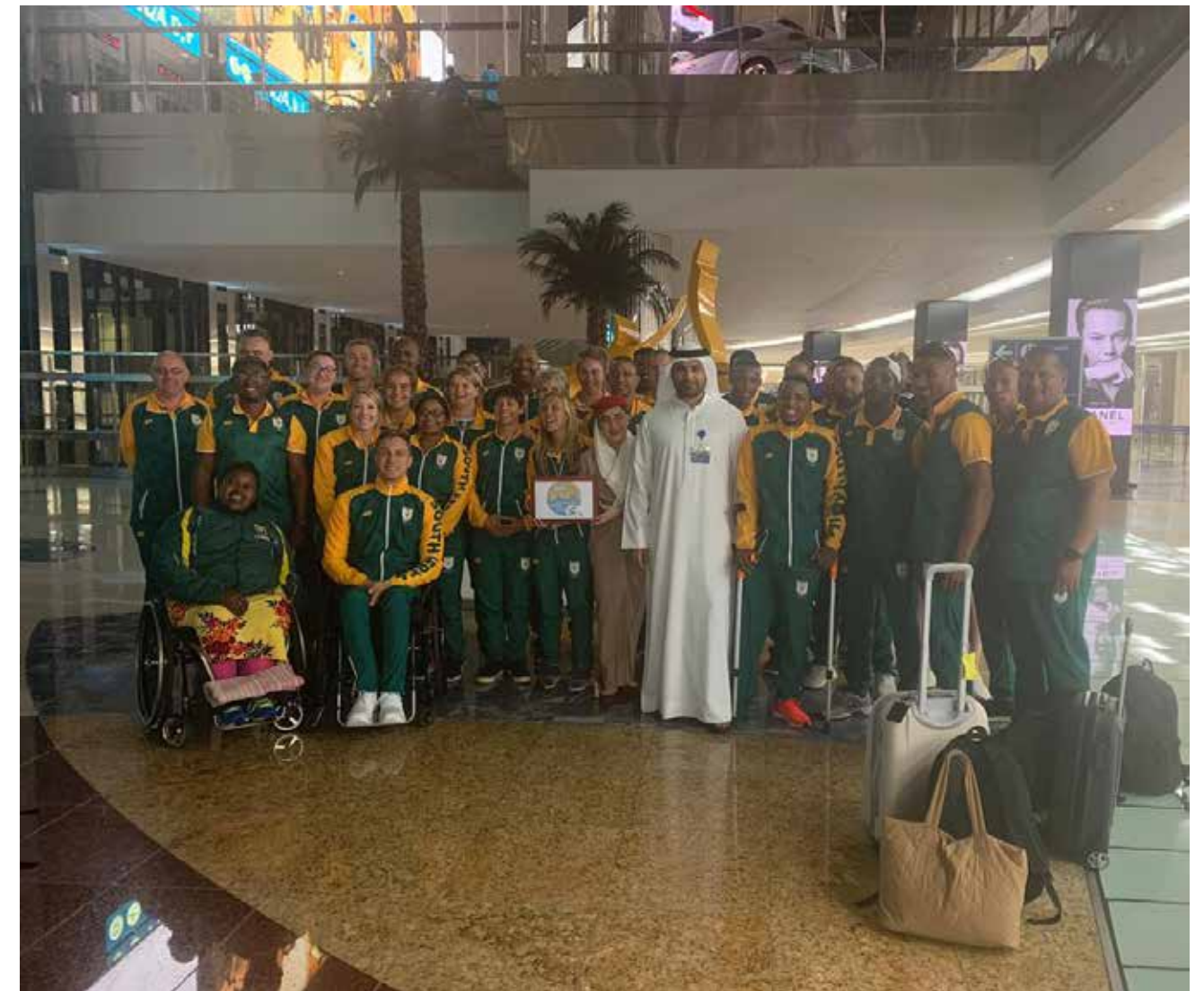
The team who represented South Africa during the World Para Athletic Games held in Dubai in November 2019