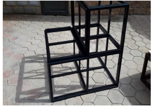
The frame of the cupboard